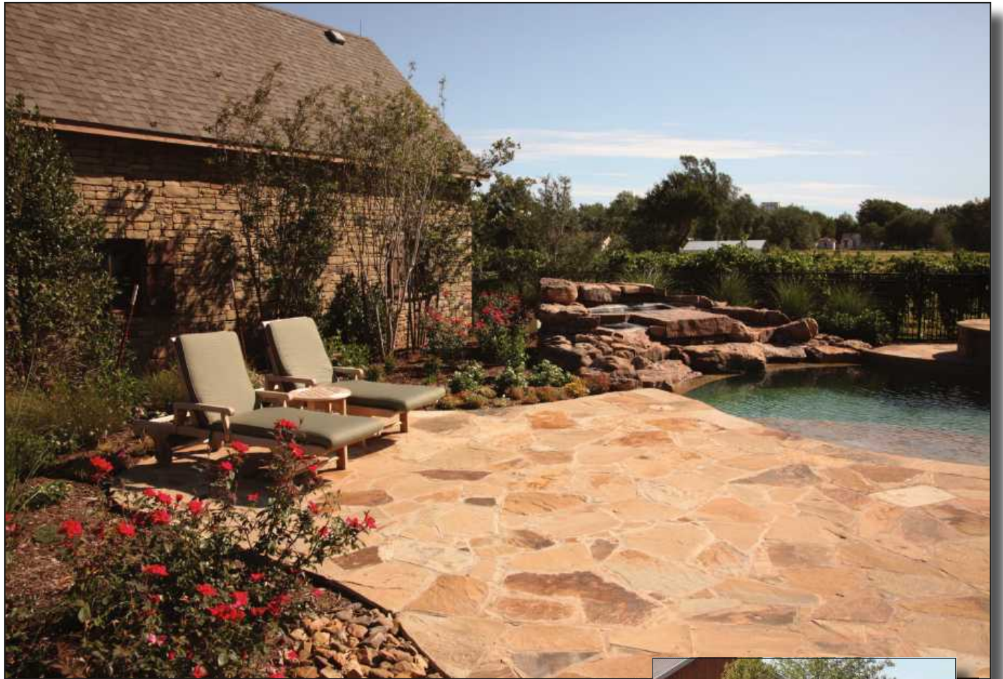
The pool area at Buffalo Point Retreat in Waukomis offers a relaxing retreat.

The Andersons have strong ties to Waukomis, where they both grew up. The high school sweethearts were raised with